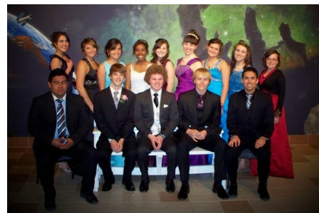
Senior Class of 2011