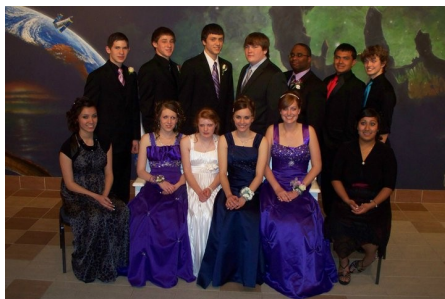
Junior Class of 2011